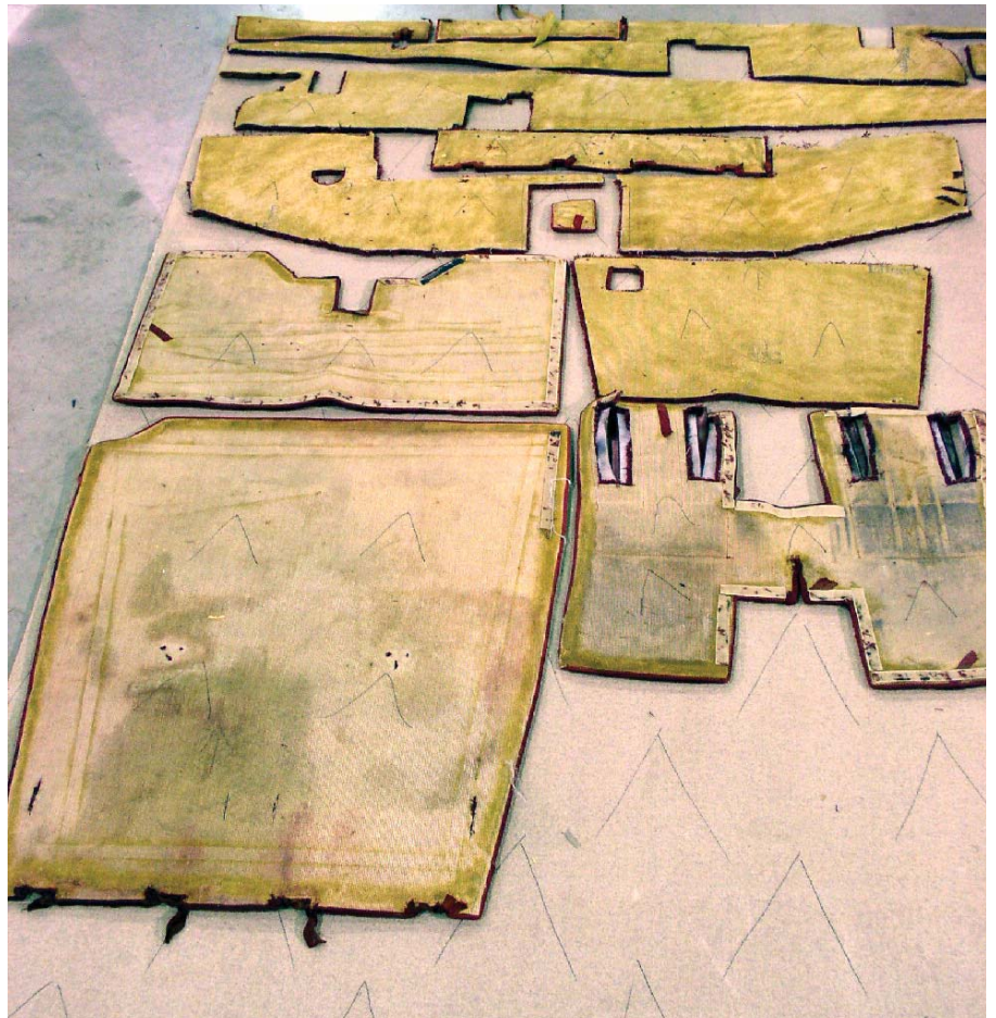
Keeping the carpet properly oriented as all of the pieces are efficiently laid out.

Since the cost of this aircraft carpet is so high, we don't order more than we need. That means laying out every sec-