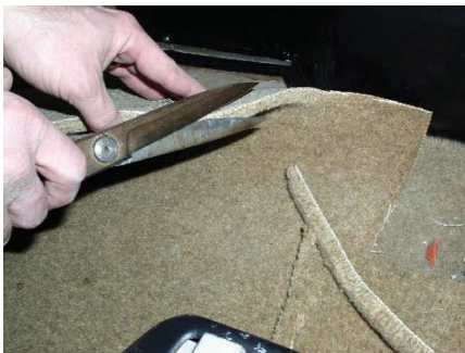
Final trimming of the carpet in the airplane.

Cut the carpet with sharp, heavy-duty industrial scissors. Razor knives are difficult to control, dull quickly and can produce a ragged cut. Scissors