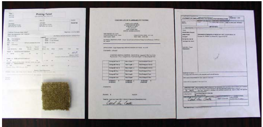
Packing list, test report and 8110-3 form.

Seat belt/shoulder harness documents. There are three documents that verify compliance for seat belts and shoulder harnesses, both new and rewbedded. 1) An identifying packing slip or invoice; 2) a certification document signed by an FAA-licensed inspector; 3) a certification tag sewn to the belt. These tags are item-specific, and must never be sewn to a different belt or harness.