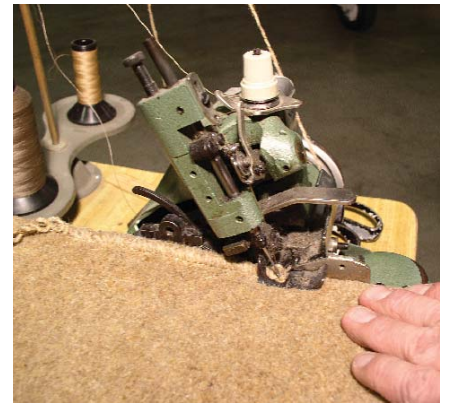
Serging the trimmed carpet.

An important detail: It's imperative that you make the emergency landing gear crank cutout large enough