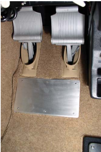
Aluminum heel pad and finished rudder pedal booties.

to hold the floor carpet in place, but with the invention of Velcro in the mid-60s, snaps are history. However, Velcro comes with its own rules. First, it must be sewn, not just glued, to the carpet. No glue will permanently hold it. Second, it must be properly secured to the cabin floors, and cleanliness is the key.