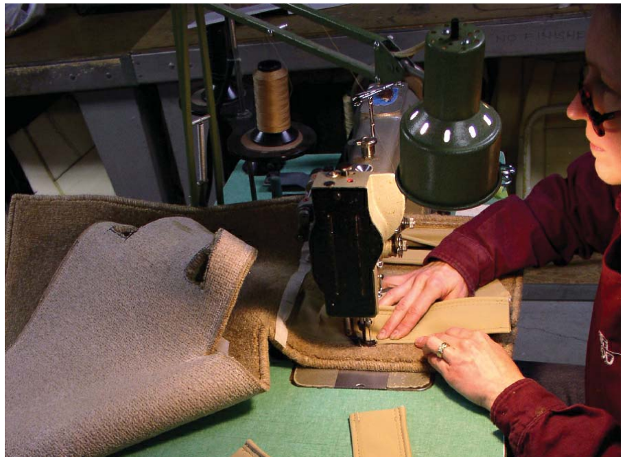
Sewing on the rudder pedal booties.