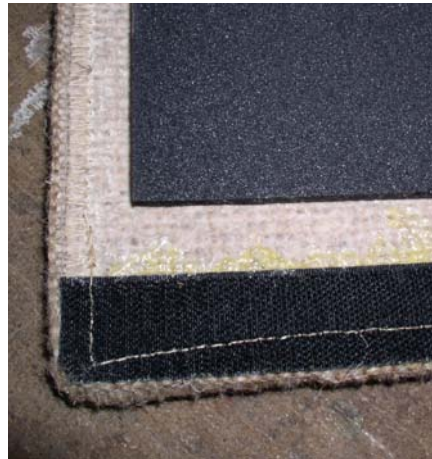
Velcro sewn to the edge of the foam-backed carpet.