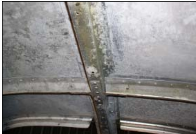
Typical corrosion found under the aft headliner of a 1974 172.

With the inner cabin cleaned and chromated, it's time to install the fiberglass insulation. I think the best bang for the buck is to use a two-part system. The method of installing this two-part system is first to bond a 5/8" thick, semi-rigid, somewhat dense fiberglass layer directly to the now clean and chromated skin. We have found that Owens Corning fiberglass ceiling tiles (with the vinyl finish layer removed) are light, locally available, flame proof, and dense enough to per-