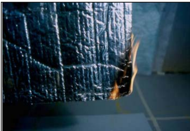
Buy only tested and approved materials (the picture says it all). This stuff was taken out of a 210

The next step is to bond as much lofted fiberglass as possible to the first layer of material. The mission here is to fill all the space between the first damping layer and the backsides of the interior components. Don't overstuff the space since compressing the lofted fiberglass reduces both its acoustical and thermal performance. We use commercial non-backed 3" thick fiberglass available at local building supply stores.