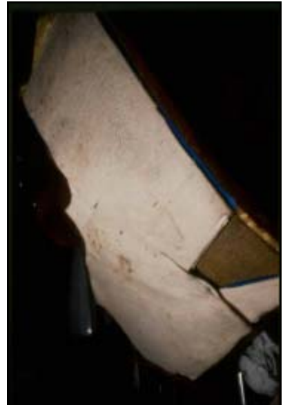
Even the backsides of the forward upholstery panels have damping materials bonded to them.

That's pretty much the sound proofing story as it exists today. Believe me when I say this is a very technical subject that I've tried to keep simple. Here's my personal opinion, for what its worth. If you can stand wearing active noise canceling headsets, and don't carry young children or pets, I probably wouldn't go beyond the less expensive fiberglass insulation system. Save the weight, and spend your money on something more fun for airplane. Until next time, fly safe.