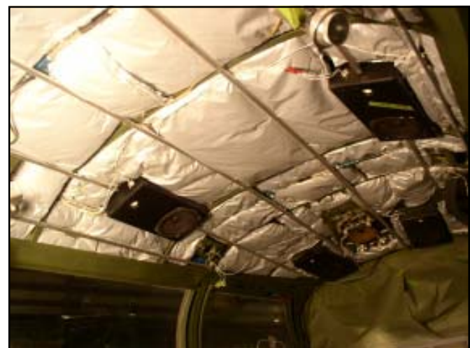
The Skandia kit installed in a 310R.

The second level of insulation is to use one of the one-size-fits-all, usually closed cell foam self-stick systems you see on the market today. As with any system, corrosion removal and protection is a pre-installation must. These systems are often available in pre-cut kits as well as raw material format. Being