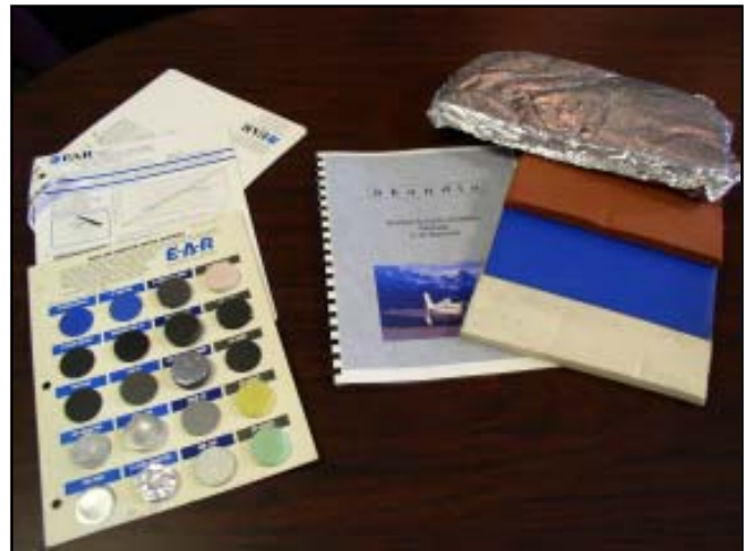
Frequency- and amplitude-specific materials as supplied in the Skandia kit, which comes with a very well written installation manual.

Brush the glue onto the skin's surface and spray it onto the fiberglass material. Allow it to cure per the instructions on the can and stick it in place. Remember, less is more so don't apply too much glue, especially to the fiberglass. Never try to