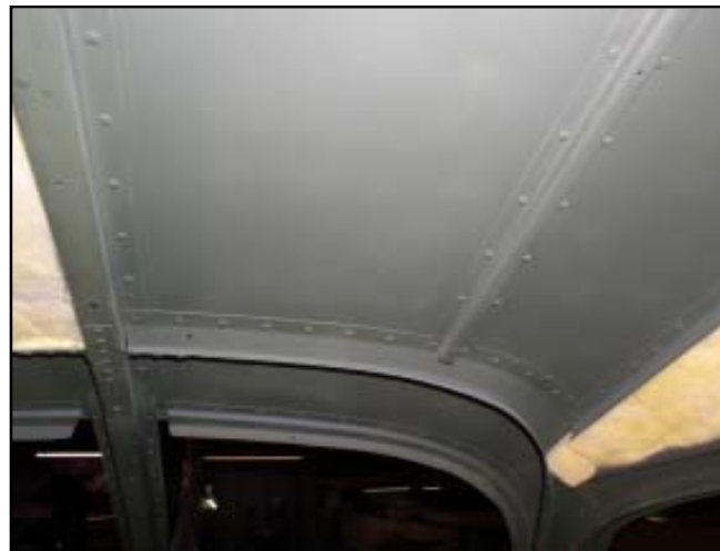
The same 172 cabin top cleaned and chromated.