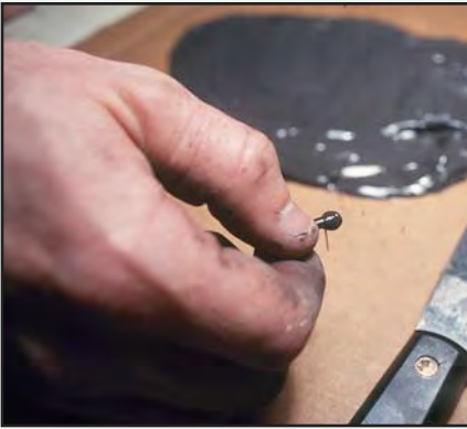
Sealer on mounting screws – very important!

piece to complete that section of the frame.