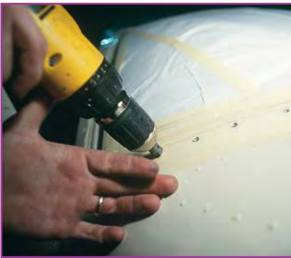
Cleaning the masking tape out of the dimpled structural mounting holes.

Remember, an advantage with using the LP Aero green sealer between the retainer frame and the structural mounting frame is the fact that both outside and inside masking (required with PRC sealer) is not necessary.