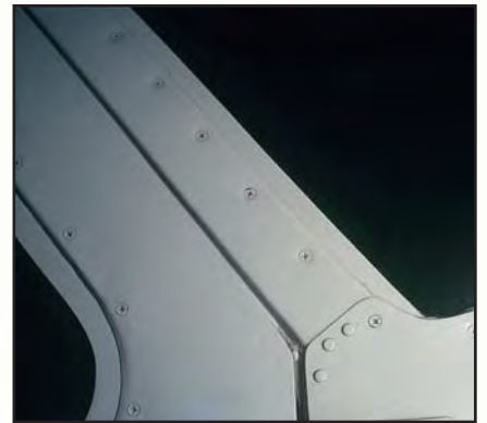
Finish out of the lower corner of the windshield outer trim.