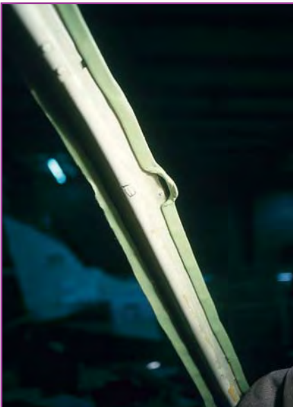
LP Aero green sealer putty applied to the structural mounting frame.

ANOTHER TIP: To keep the PRC sealer from getting into the pores of your skin (it will and it's impossible to get off), rub liquid dishwashing detergent into your hands until it is dry. This puts a water-soluble coating on your hands that will go a long way in releasing the PRC sealer when you wash up at job's end. I know, you're going to wear rubber gloves, but one little hole is all it takes to cause a problem. Use the soap – it's cheap insurance.