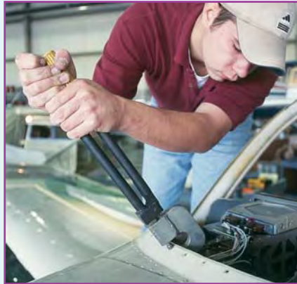
Dimpling the structural mounting holes.

A special tool is used with the dimpling die to create a countersunk structural mounting hole, but there's definitely a word of caution. You must be careful to keep the dimpling tool and dies properly aligned when dimpling the mounting holes. Failure to do so will result in a deformed skin.