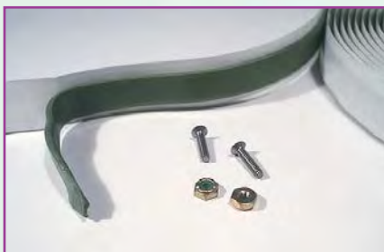
LP Aero green seal caulk, machine screws and thin self-locking nuts.

These items are available at Aircraft Spruce & Specialty (877-477-7823). If you choose to use the countersunk screw method, it will be necessary to dimple the structural frame mounting holes. This involves buying a set of $15 #6 dimpling dies from Air Parts, Inc. (800-800-3229). (See photo)