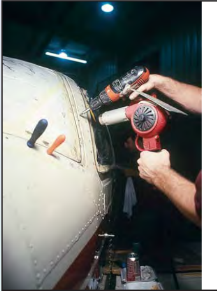
Outside person heating the LP Aero Green Sealer as the mountings are being tightened.

As the mounting screws are being installed, the person on the inside must install the sequentially numbered window trim mounting tabs in their appropriate locations. Remember, they are held in place by the structural mounting screws and nuts.