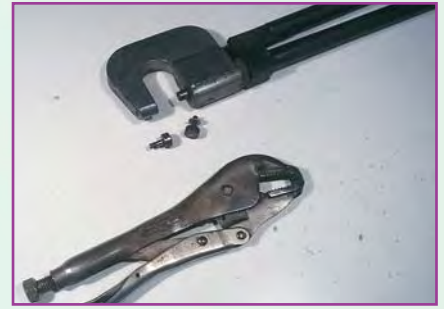
Homemade vice grip rivet squeezer.

It is very important that when this window is finally installed it is under as little stress as possible. To this end, we like to install the framed window assembly permanently