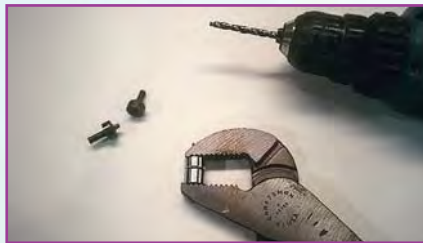
Homemade dimpling tool.

Also, due to the thin outer cabin skin, it is not a good idea to countersink the mounting holes with a cutting type countersink. Two things can happen: