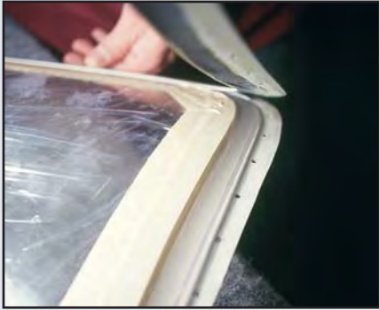
Be careful to apply PRC sealer to only the outer part of the opening window frame. Proper masking is also a must.

Fourth, you should definitely paint the inner half of the frame while the Plexiglas window is removed. It is really difficult to mask and paint the window frame once that window is installed.