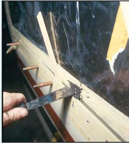
Using a putty knife to force sealer between the window and the structural frame. Paint sticks help open the gap to allow the sealer to flow into the structure.

the best way to go is Lew Gage's method described in the September 2004 ABS Magazine . This also works well on frameless windows. Don't forget to put sealer on the threads of the mounting screws before they are installed.