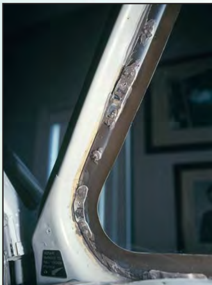
New double mount window frame mounting tabs. Note the radiused corner pieces.

TIP: To help make the earlier style of thin aluminum window trim strips fit to perfection, throw the original mounting tabs into the garbage and fabricate new .032-inch aluminum hat section tabs that mount at each end. This will help the window frames fit very securely. It also allows you to drill a new mounting hole in exactly the right location for a perfect fit of those pesky window strips. The tighter they fit, the better they look, especially on frameless windows.