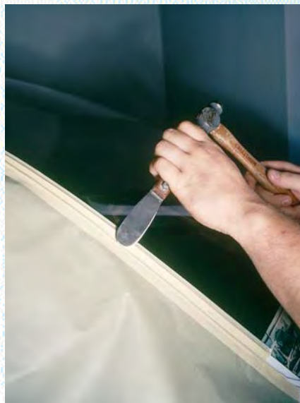
Using sharpened putty knife to cut sealer loose.

• Many Beech windows were installed with the very tenacious catalyzed PRC-type sealer, so it will be necessary to cut the sealer between the window and the airframe. The best method I know is to buy a very thin putty knife and sharpen the end and one side of the blade. Using a small mallet, tap the sharpened putty knife between the airframe skin and the outer surface of the window. This procedure is also used to separate the now rivetless cuff of a D'Shannon speedsloped windshield from the airframe.