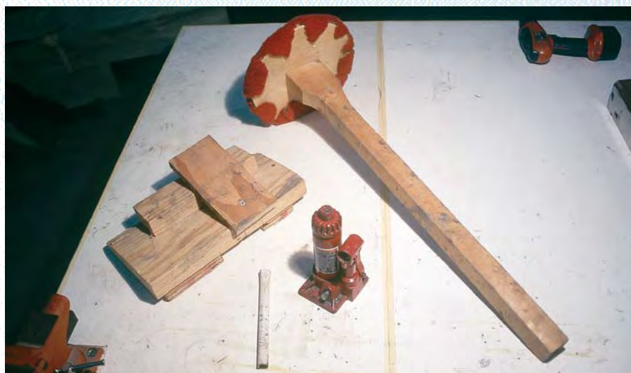
Homemade rail and wood base used with the small bottle jack to lift/push the new windshield into place.

As shown in the photo, the tools required are a small bottle jack, a wood ram with a padded end disk, and a properly contoured wood base to securely hold the bottle jack on the spar at just the right angle to prevent slippage. This method gives you a lot of control in forcing the windshield past the hat section of the structural frame.