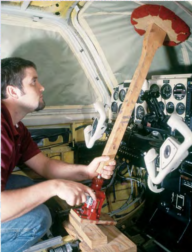
Bottle jack and the base and rail tools are used to push the windshield past the hat section of the structural frame with a great amount of control.