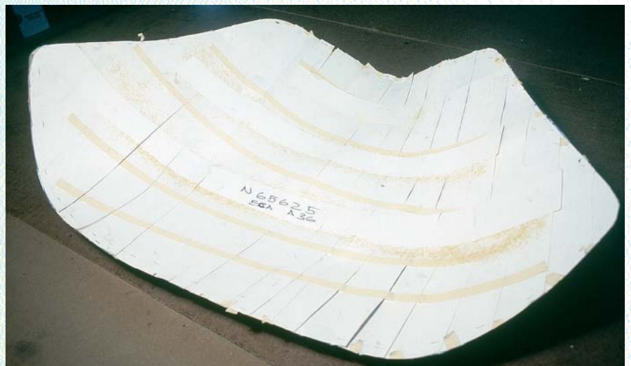
Compound-shaped pattern of original windshield, made from strips of pattern paper.

The first thing that should be done when the windows arrive is to check for manufacturer defects. Take the window out of the box and remove the protective covering. Have someone hold the window upright on a table, then step back 4 or 5 feet and look through the