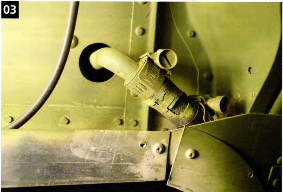
Problems such as this degraded static and fuel line can be seen once the interior is removed.