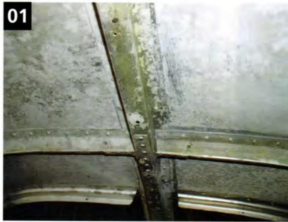
Many older airframes exhibit corrosion. With proper mitigation, degradation can be slowed or stopped.