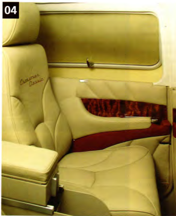
Composite side panels with recessed armrests are one of many ways to upgrade a Cessna interior.

Please contact him at 330-698-0280 ext.224 gene@preferredairparts.com