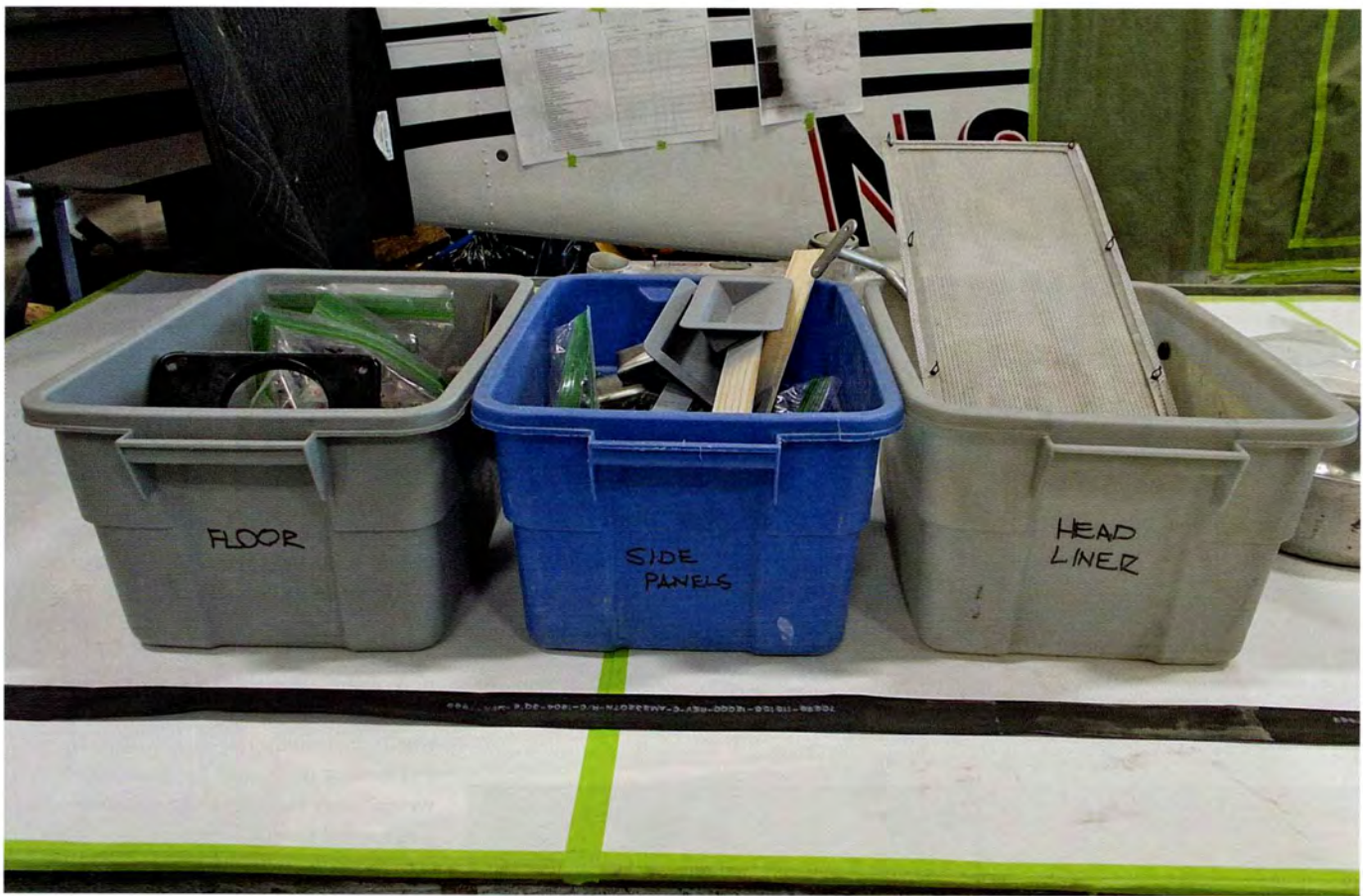
Storage tubs for cabin components.