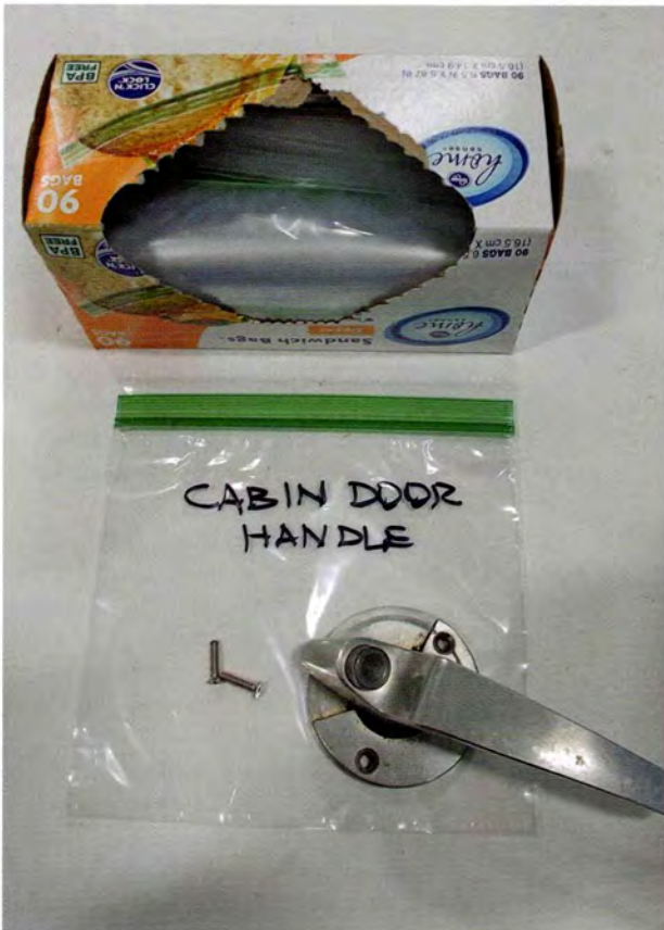
Labeled storage bags for small parts.