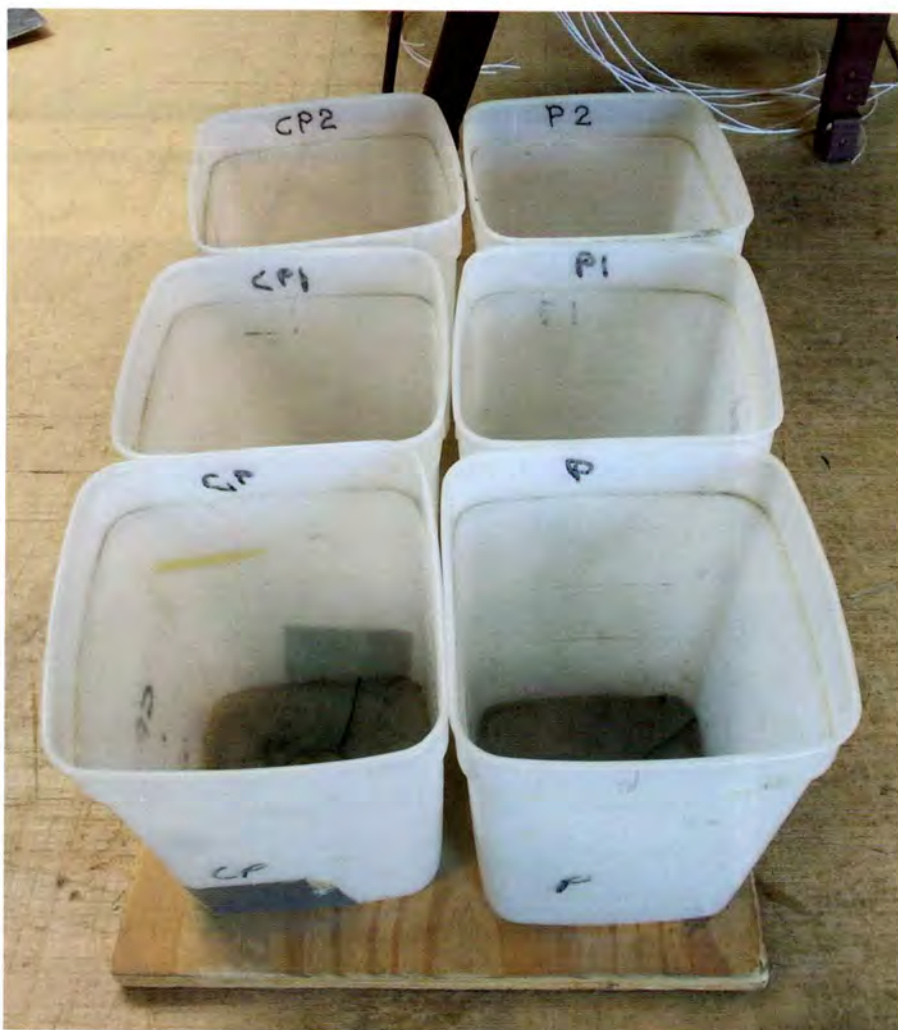
Organized storage for seat parts (in this case, for a six-place airplane).

or six boxes to a wood base with sheet metal screws. This creates a handy compartmentalized tray with one compartment for each seat that will neatly store seat rollers, actuating handles, reclining parts, etc.