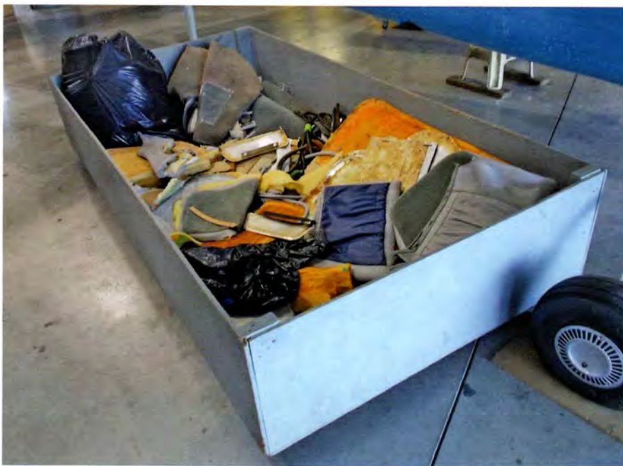
Larger components stored in a 4-foot by 8-foot by 2-foot roll-around box.